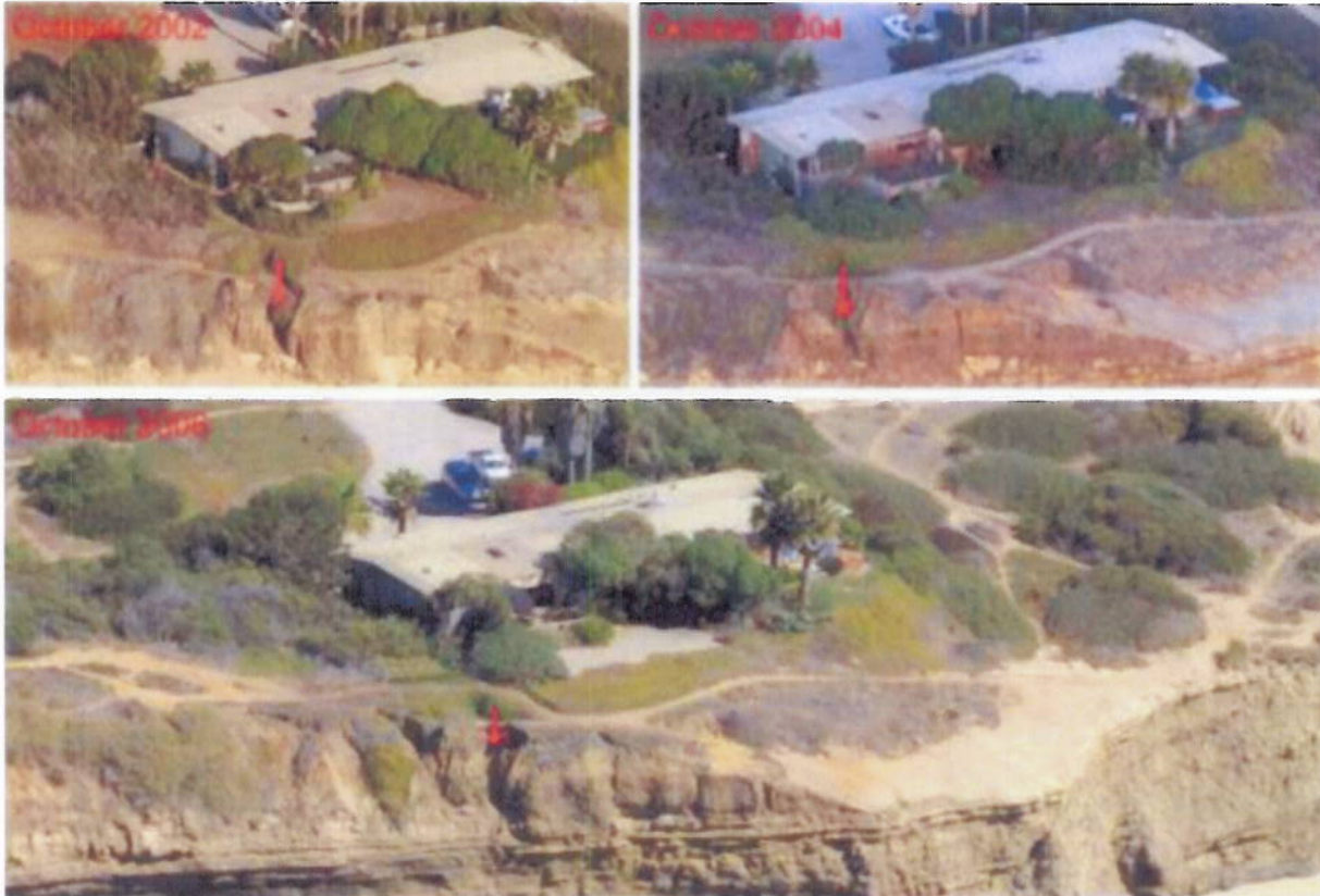
Figure 10. From October 2002 through October 2006, the runoff from this property increased the number of erosion gullies in this section of SCNP, and noticeably expanded the one marked with a red arrow. A new gully to the north formed over a couple of days in early February 2005, and severed the trail that ran near the edge of the cliff (see next figure). Removal of the built surfaces, restoration of the land with appropriate contouring and native plant cover, should stop this top-down erosion.