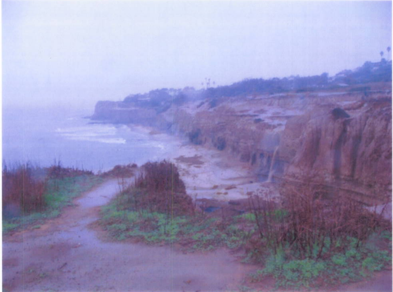
Figure 3. Rainstorm October 5, 2011, 0.4" rainfall

The Application fails to recognize that the SCNP, in addition to being a wonderful 1.5 mile long coastline area of San Diego with magnificent view sheds and open space accessible to the Public, also provides access to intertidal and subtidal habitats that have been continuously degraded by the accelerated erosion from run-on and runoff through SCNP from the late 1970s forward. Erosion and marine problems were officially reported in a 1992 letter from the San Diego Water Board to the City requesting the City resolve the marine pollution issues plaguing the SCNP before the next rainy season.