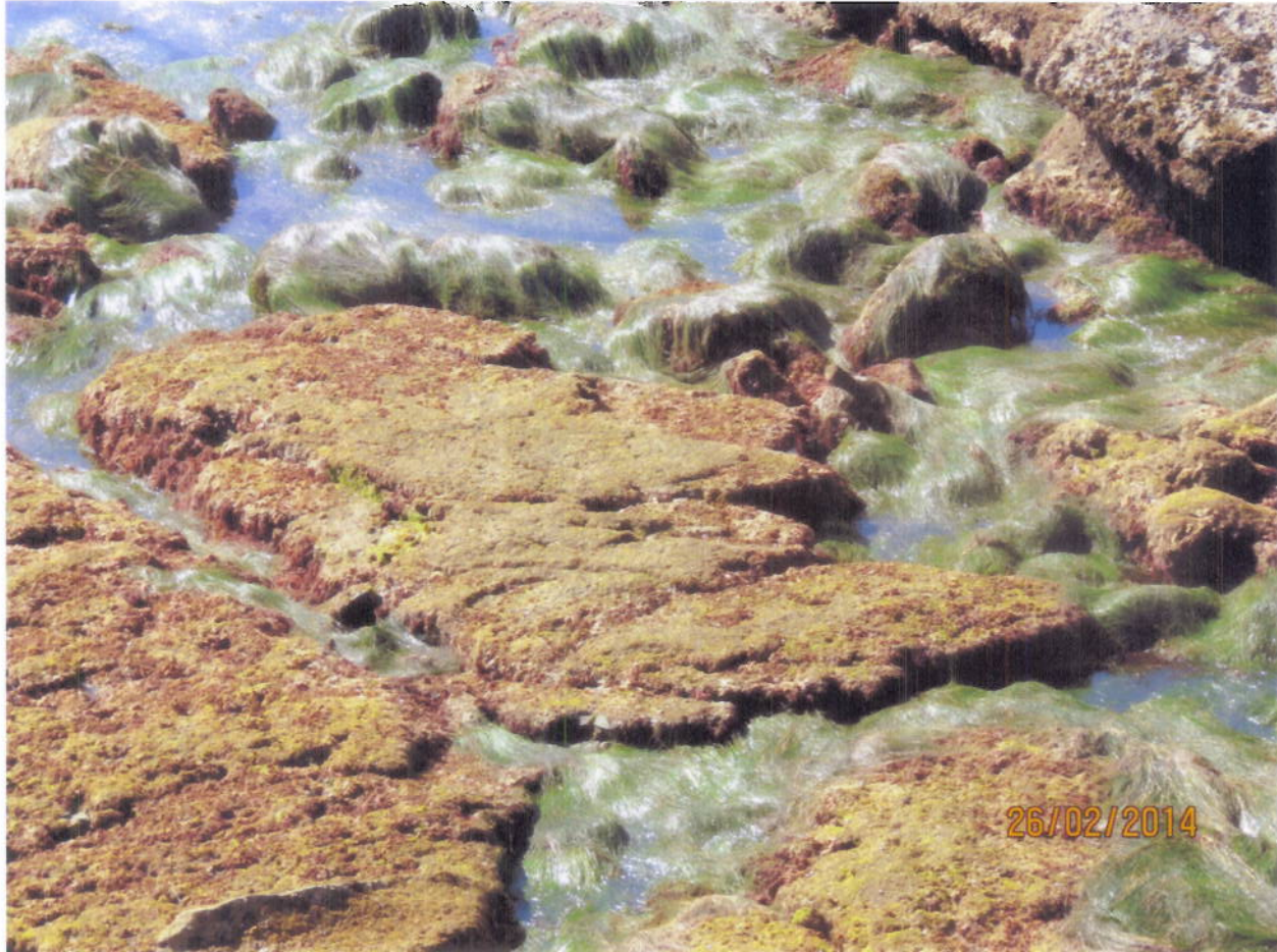
Figure 4. SCNP surfgrass exposed at low tide.