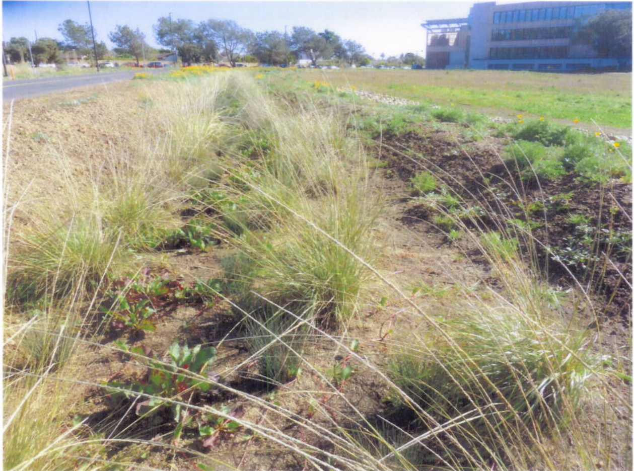
Figure 5. Bioswale, 5-months after installation, Scripps Upper Mesa, Univ. Calif., San Diego, showing one that is wide and deep enough, with use of California native plants, to provide treatment and allow infiltration of the runoff that it collects, except perhaps in a 100-year storm.