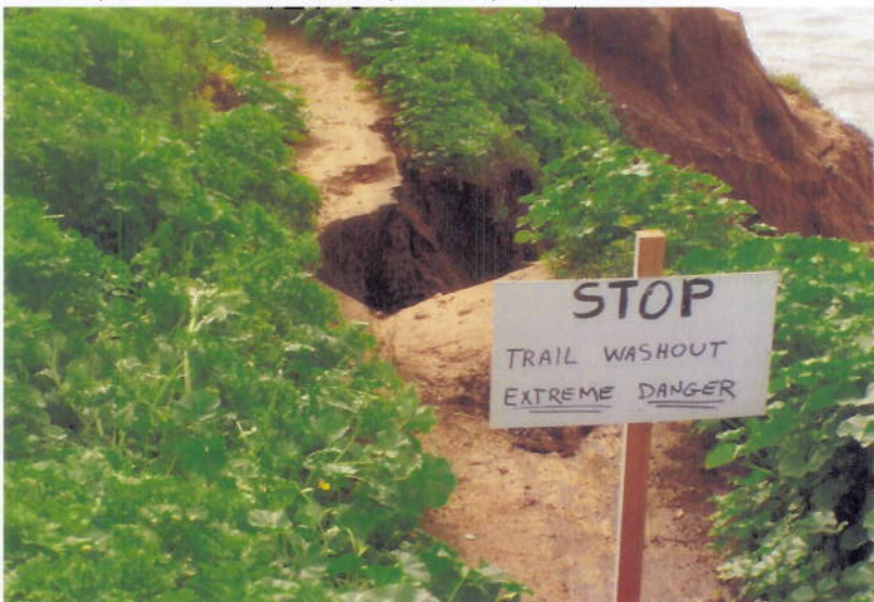
Figure 11. Bluff trail washout due to runoff from the Ladera Street property.