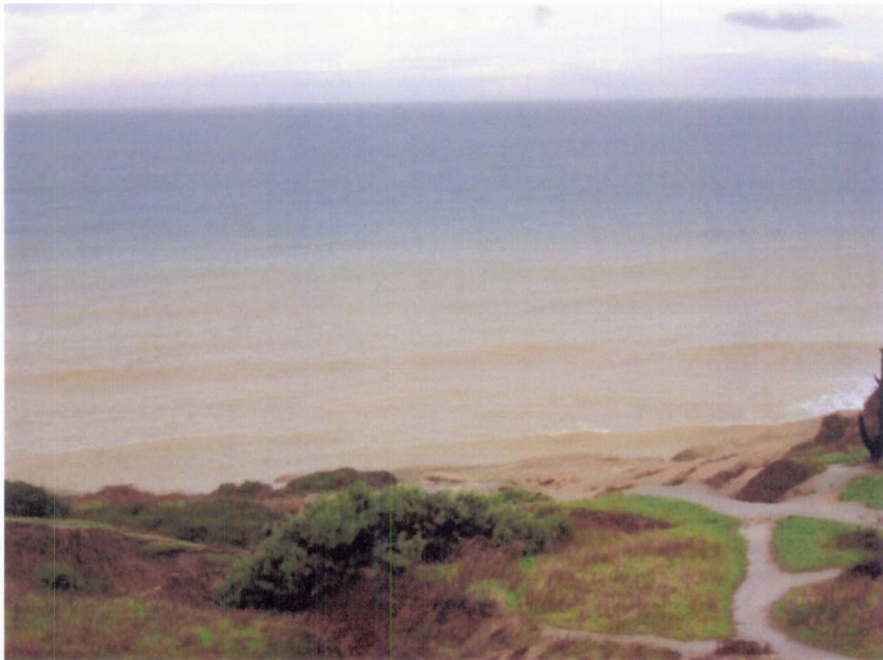
Figure 1. Nearshore turbidity plume April 20, 2007, generated by a 0.38" rainfall.