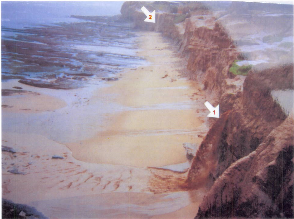
of Garbage Beach looking north, after a 0.1-inch rainfall event on saturated soil.