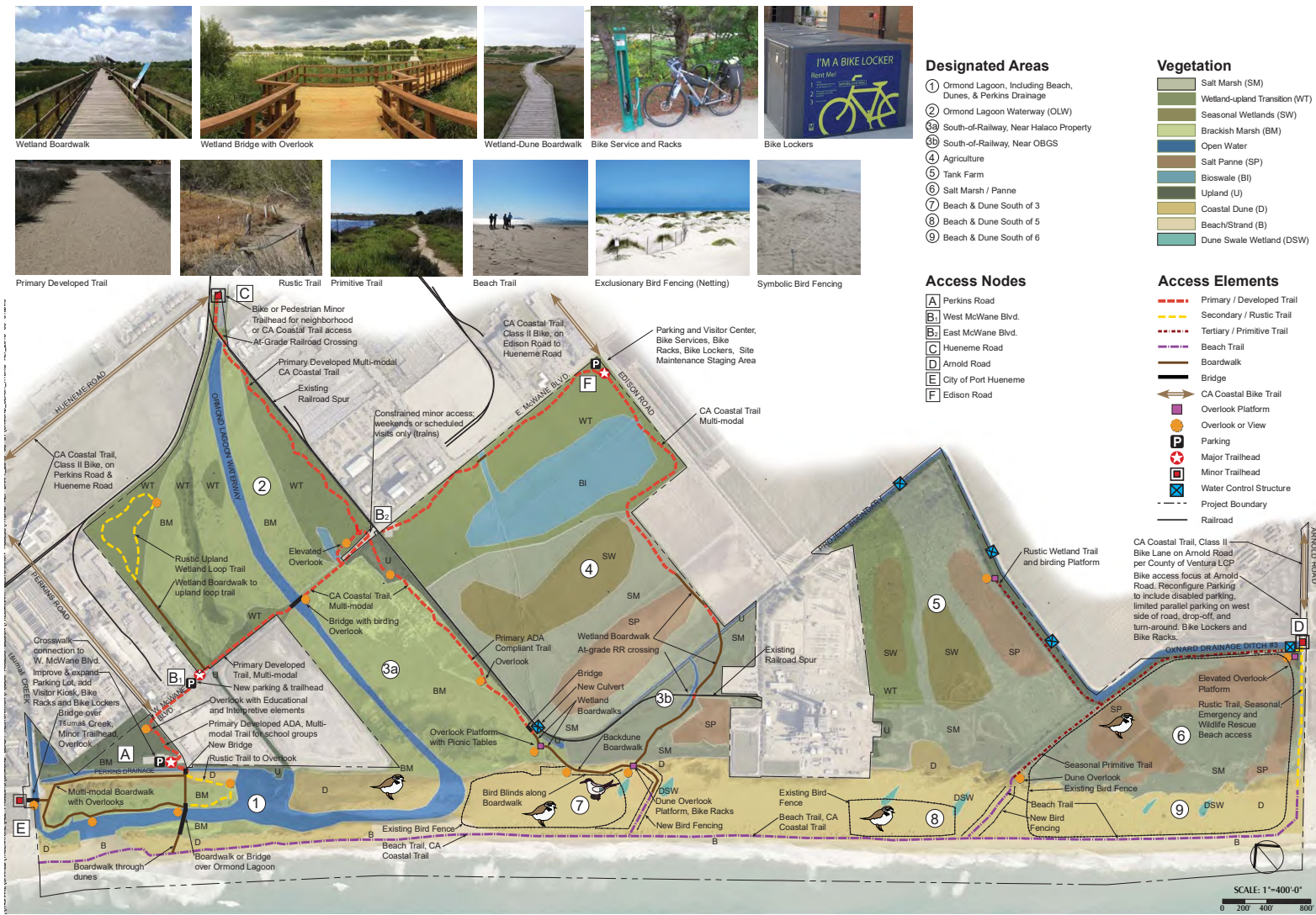
Exhibit 3: Ormond Beach Restoration and Public Access Plan