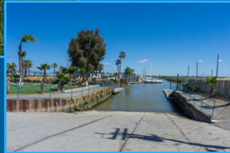
McAvoy Yacht Harbor