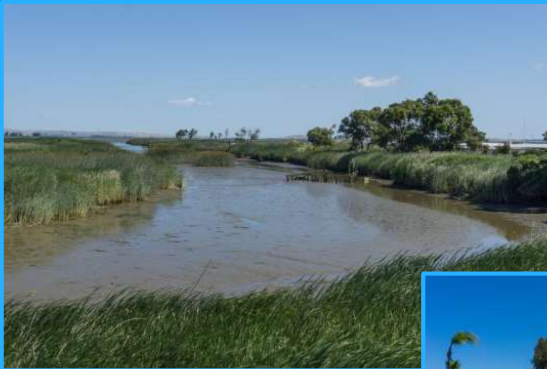
Bay Point Regional Shoreline