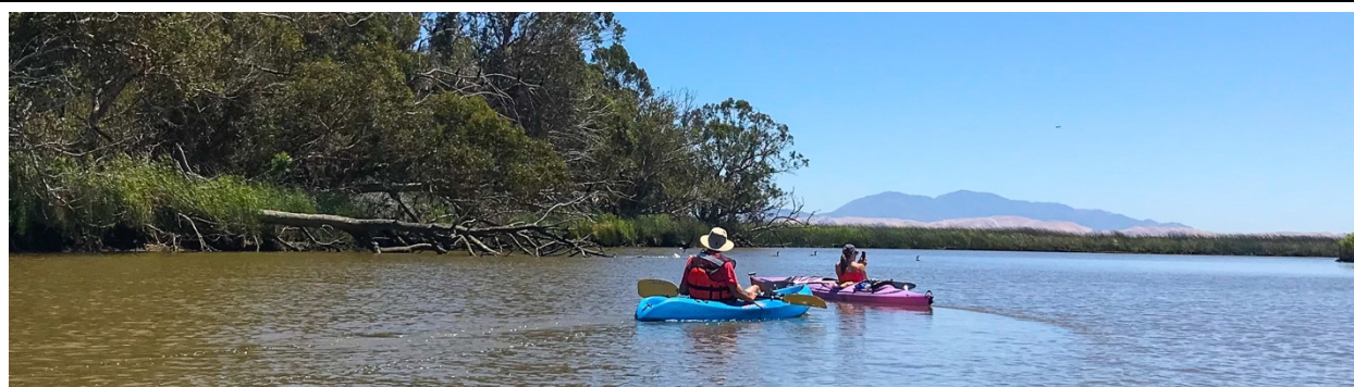
Belden's Landing offers access to miles of scenic sloughs

Facility Description: Belden's Landing provides a wide launch ramp for motorized and non-motorized boats and a high-freeboard dock. The facility also provides parking (including trailer parking), restrooms, trash receptacles, informational signage, a fish cleaning station, and picnic tables. A fishing pier and boardwalk are located south of the launch, though the fishing pier was damaged during the Branscombe Fire and is currently closed and awaiting repair. There is a parking fee but launching is free for non-trailerred crafts.