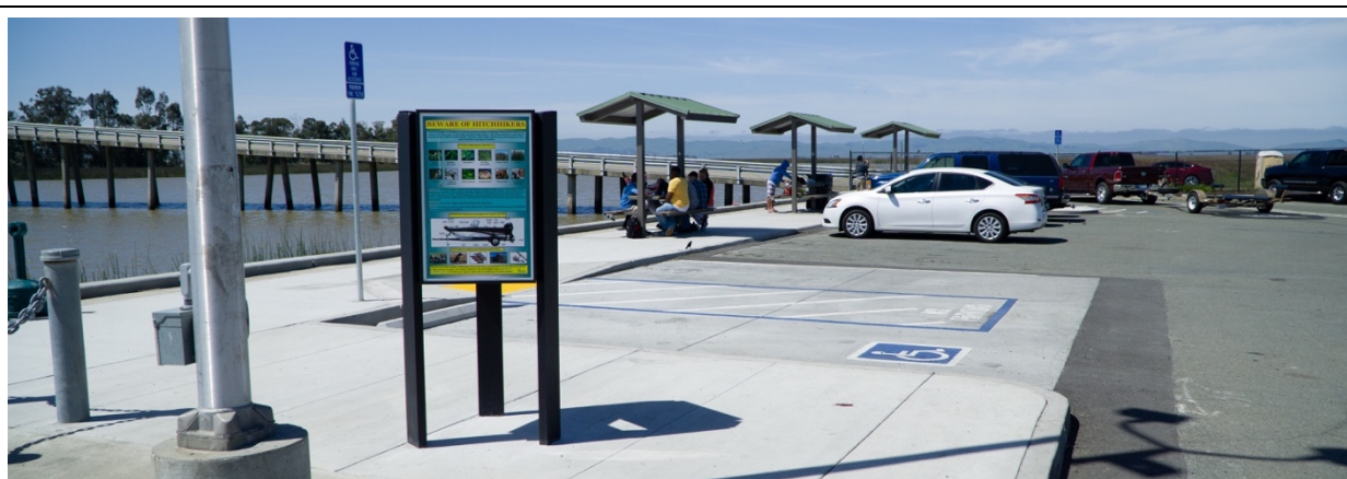
Interpretive signs at the top of the launch provide information on the local ecology and fishing regulations. Additional Water Trail signage and maps would be provided upon designation.

Most of Suisun Marsh is private property or sensitive habitat restoration areas that do not allow public access. Paddlers should plan their trips accordingly to ensure they only launch and land from public facilities.