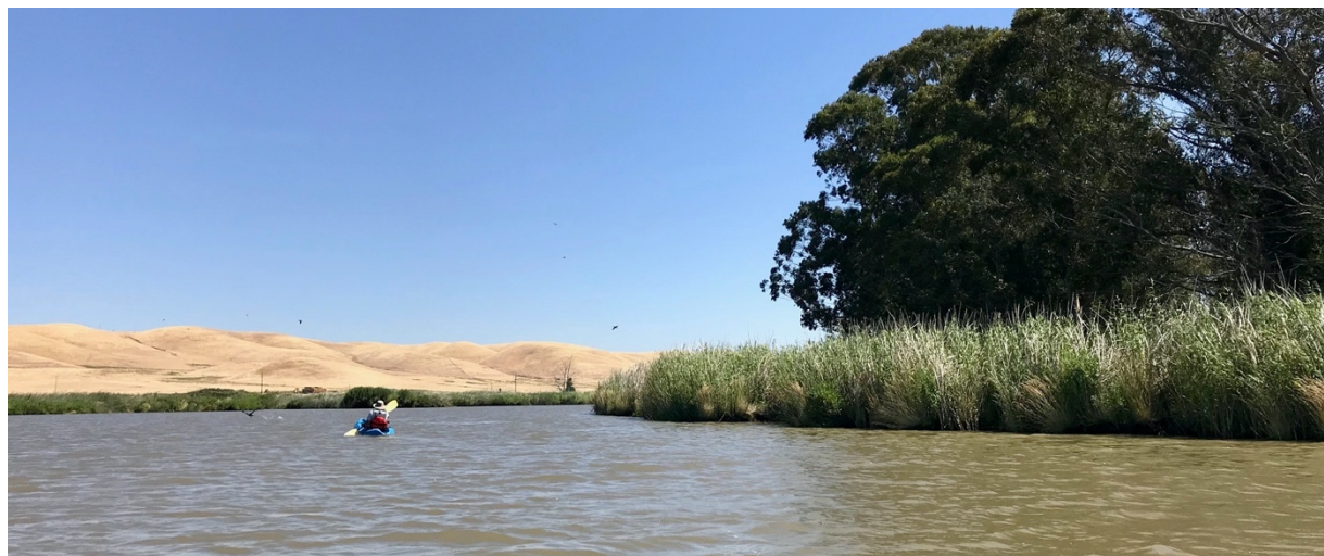
The Water Trail educational sign directs users not to land in marshes and to keep a distance from sensitive species.

Suisun Marsh is one of the last large fragments of a relatively intact prehistoric tidal marsh. Salt marsh harvest mice and black rail are found throughout the marsh. Ridgeway rails have been detected near Rush Ranch. A heronry exists within four miles of the launch site. There are also endangered and rare plant species found in the area, including the Suisun thistle and soft bird's beak. Rafting waterfowl may be present.