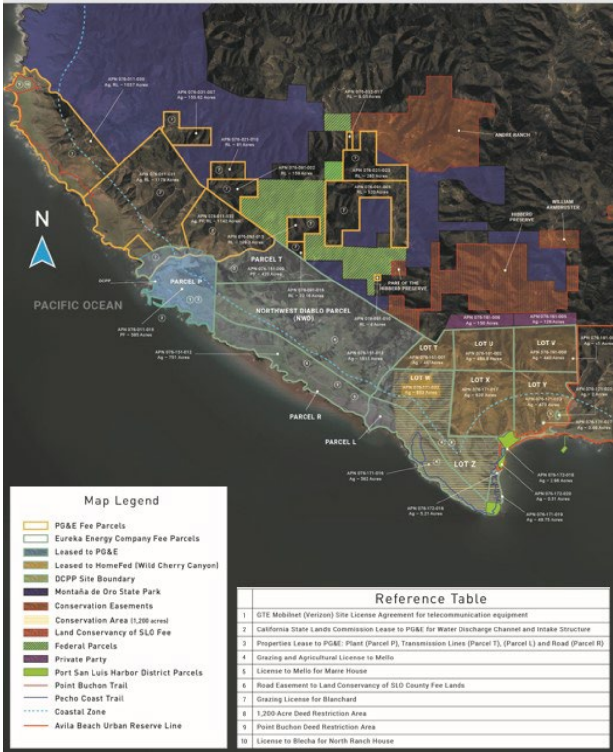
Figure 2: Diablo Canyon Land Ownership