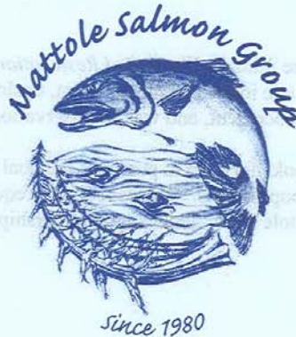
Exhibit 4: Letters of Support