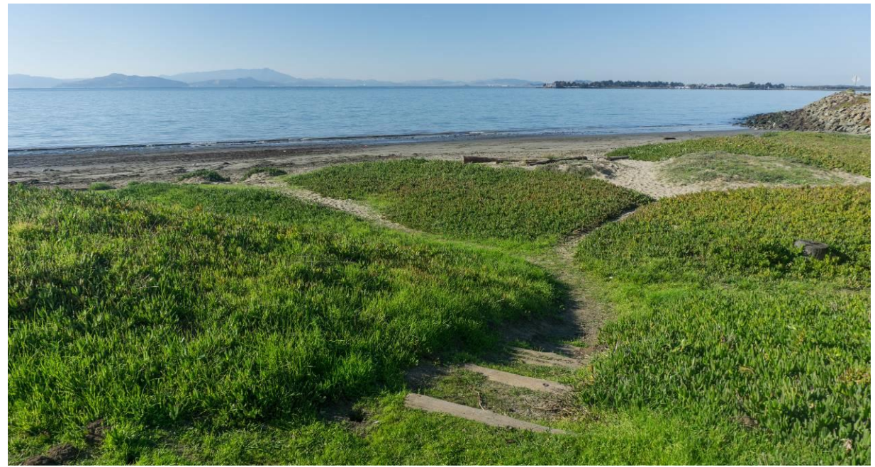
Path of Travel Description: The beach access path leads approximately 50 feet from the parking lot, down a small set of steps, and through small dunes to the sandy beach.