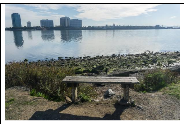
Benches and a walking path make Point Emery a scenic destination for paddlers.