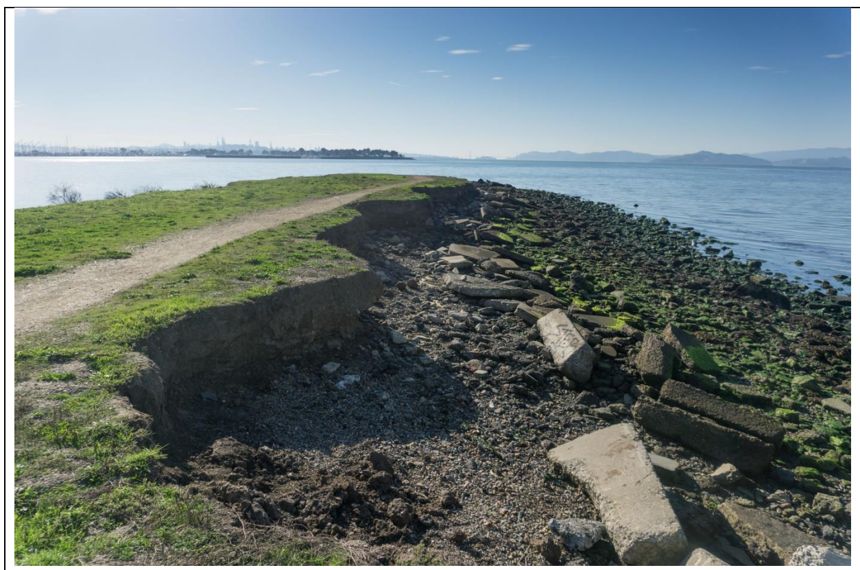
The City of Emeryville Capital Improvement Plan includes a project that would install shoreline protection (riprap) along the unprotected portions of the northern shoreline and the western-most portions of the south shoreline of Point Emery. These improvements should take into account windsurfer access.