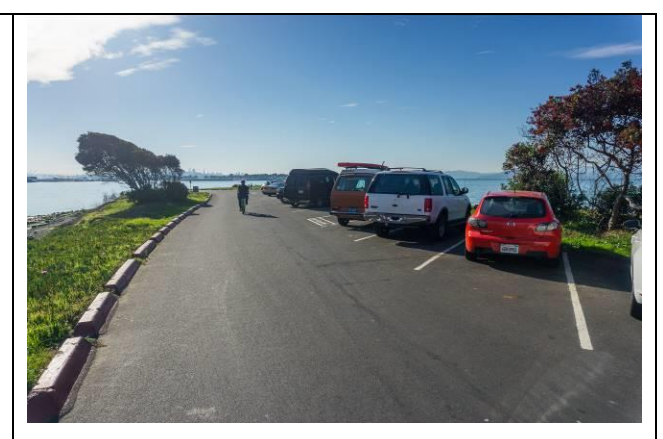
Park hours are 7AM to 9PM. There is no parking time limit during these hours, which is important to paddlers or windsailors seeking longer excursions on the Bay.